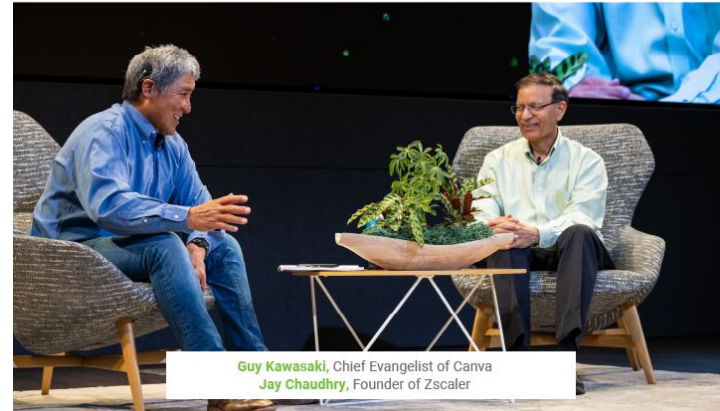
Guy Kawasaki, Chief Evangelist of Canva Jay Chaudhry, Founder of Zscaler