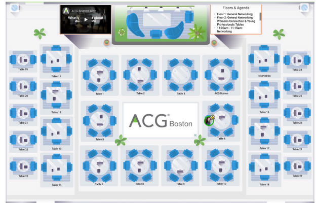
The Remo Platform