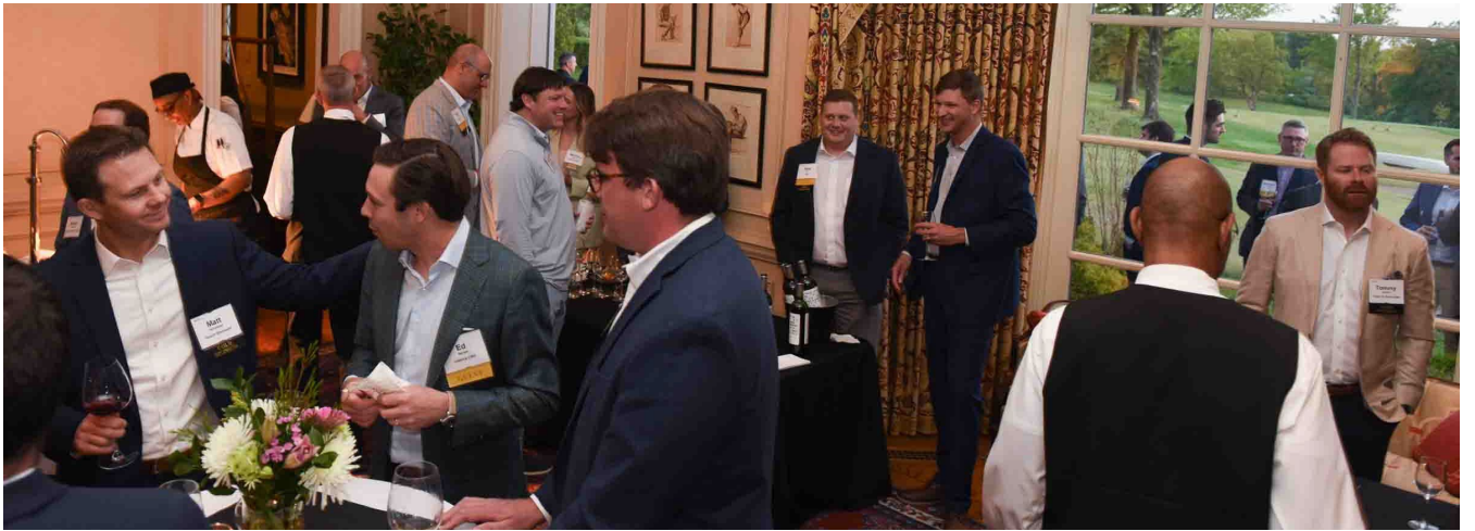
Table Sponsor: $2,500